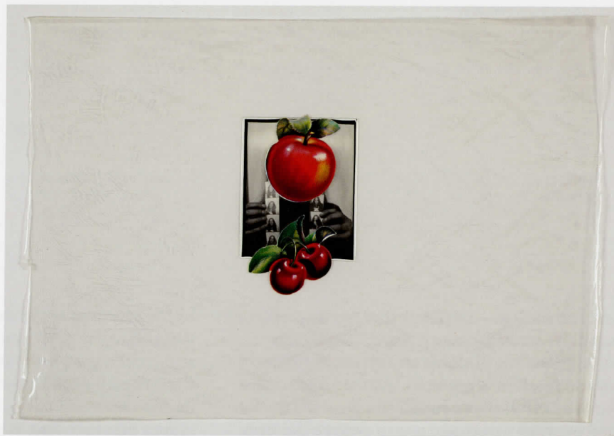
Untitled, Self-Portrait with Apple and Cherries (1975) by Barbara Astman. Silver gelatin print with stickers and plastic laminate. Photo: Art Gallery of Ontario (Toronto) COURTESY THE ARTIST AND CORKIN GALLERY (TORONTO)